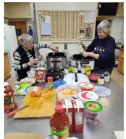
Preparing soup to take for Watered Gardens dinner

St. Philip's prepares and serves a meal at Watered Gardens the 4 th Thursday of every month. Talk to someone who has participated and you will hear about what a great experience it is. Sign-up sheets are in the parish hall. Think about signing up.