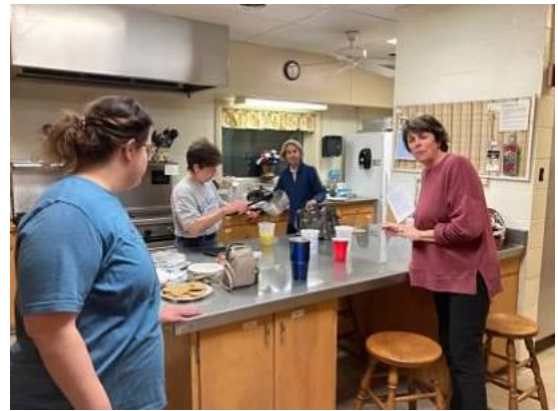
St. Ann's members fixed their renowned tomato soup and grilled cheese sandwiches for the light meal on Feb 21 st