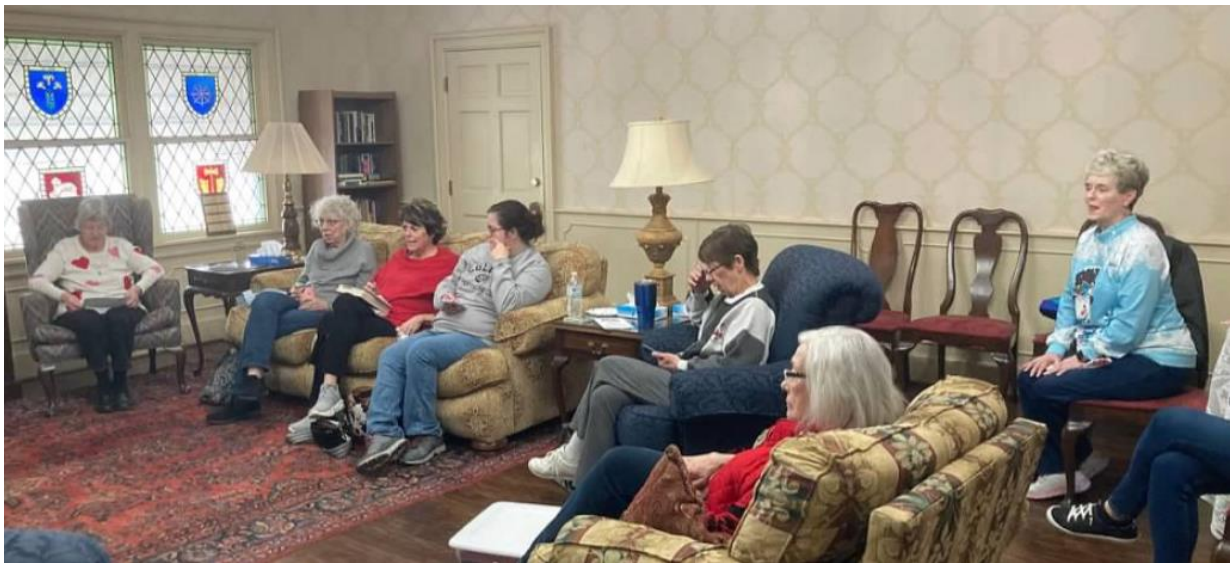
St. Ann's 1 st meeting in 2024

March 30 th – 9:30AM – This work day prepares the sanctuary for Easter morning. St. Philip's is transformed for this wonderful day in our Christian calendar.