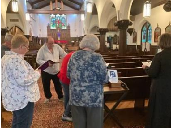
Stations of the Cross – Feb 21 st

The Wednesday evening schedule in Lent includes Stations of the Cross at 5:30PM, followed by Mass at 6PM. A light meal hosted by groups within the parish begins at 6:30PM, followed by a program that ends by 8PM. This year the program will be led by artists who have contributed their original depictions. Please join these evenings for fellowship and discussions. Child care will be provided.